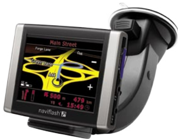
naviflash on TMC window mount (illustration similar)